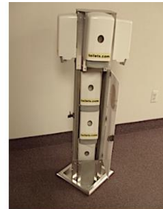
Hand Sanitizer Station with Storage