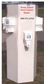
Folding Hand Sanitizer Station