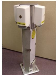
Hand Sanitizer Station